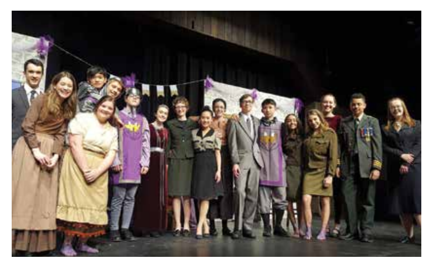
The talented cast of "The Mouse that Roared" showing off their creative costumes.