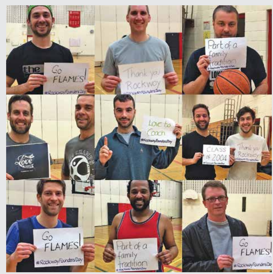
Happy Rockway Founders' Day 2018 from some of your alumni recreational basketball friends!