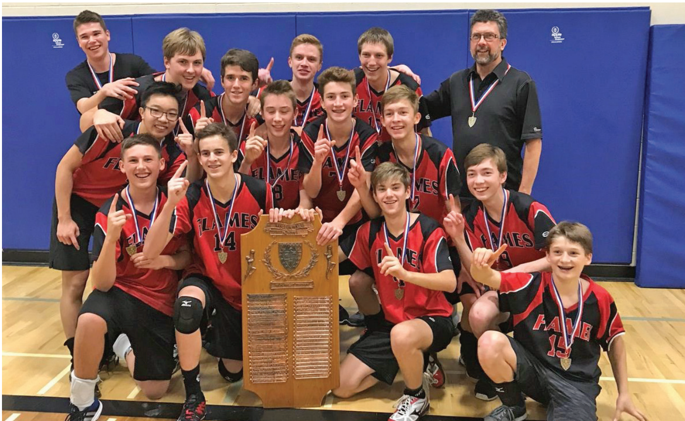
2017 CWOSSA 'A' Junior Boys Volleyball champions. Congratulations also to the Senior Boys who won silver.