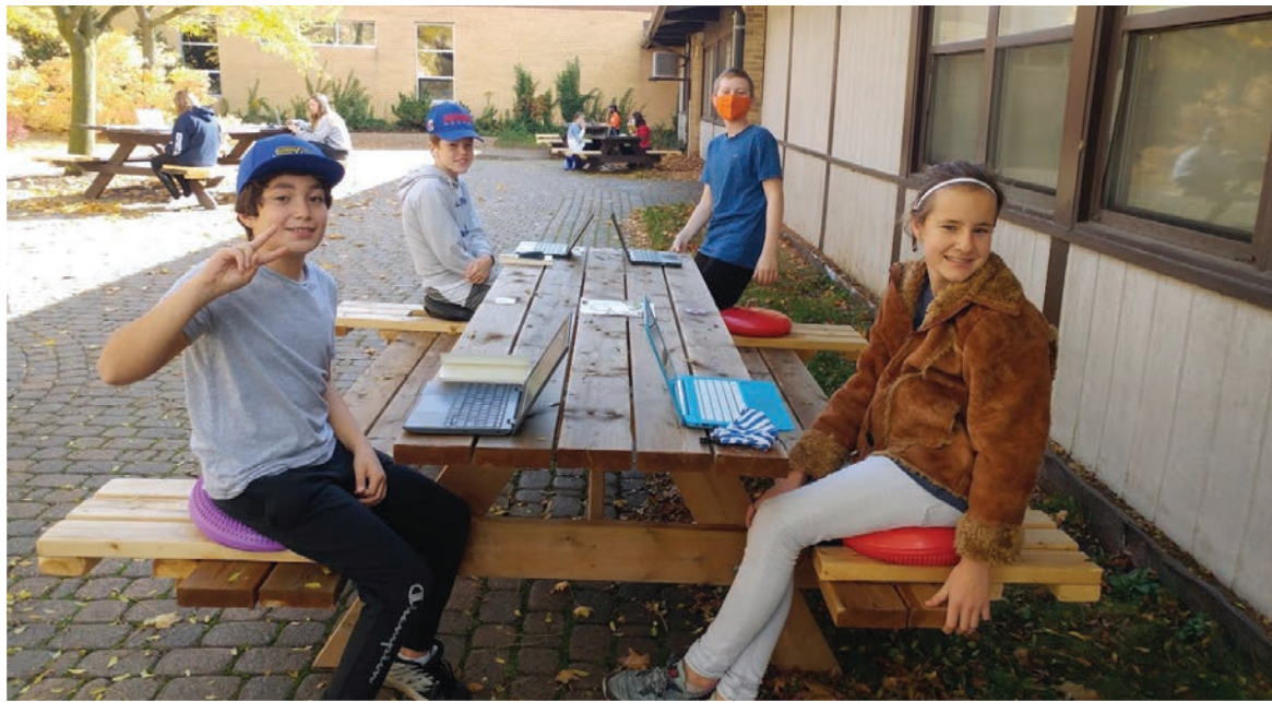
Grade 7 students working outside on a beautiful fall day! The picnic tables were retro-fitted to allow for six feet of safe outdoor learning.