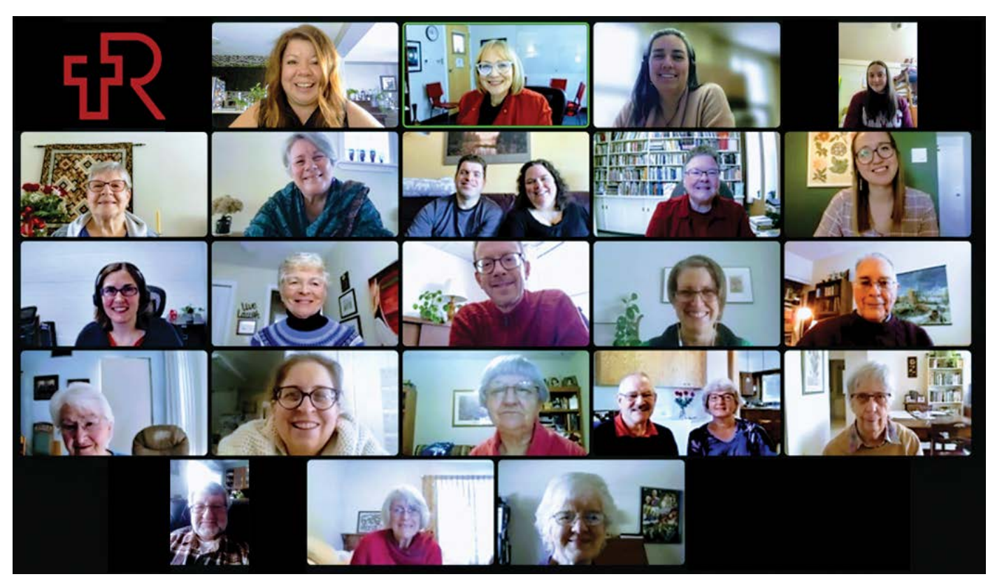
Thanks to our amazing alumni who took the time to join us online!

At the same time that students, faculty and staff were celebrating, alumni and parents (both former and current) were participating in a Founders' Day Chapel Zoom call ( see above ).