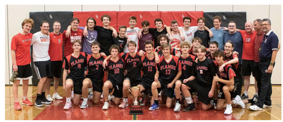
The Sr. Boys Volleyball team pose with the alumni team whom they beat in a best of 5 match contest.

Following the meal, we held our ever-popular Alumni Sports Challenge. The stands were packed as our Sr. Girls Basketball team was challenged by a determined group of alumnae. It was a fun and entertaining match with the alumnae coming out victorious. The number of alumni