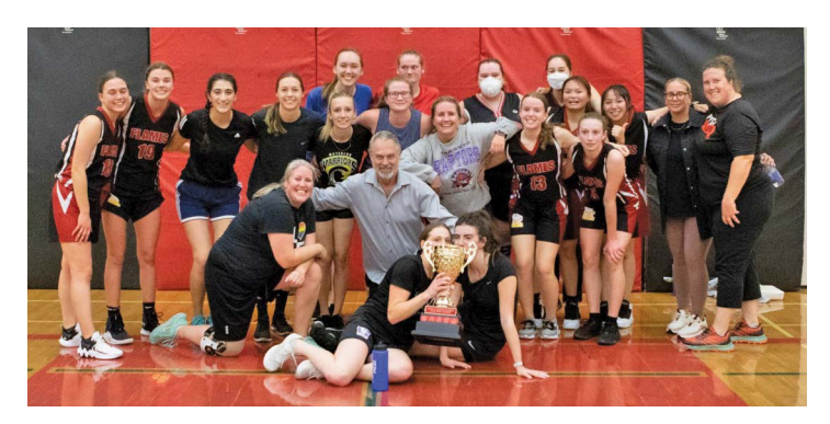
The Sr. Girls Basketball team and alumnae team pose after a fun and competitive game.

that came out to challenge the Senior Boys Volleyball team was impressive. They played a best of five match and needed all five games to determine a winner. Each game went back and forth, but for the