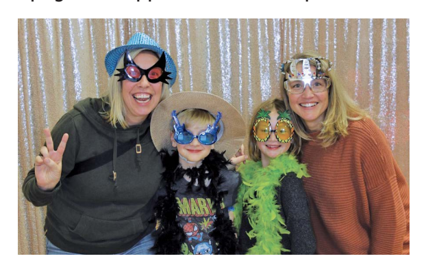
The photo booth was very popular with attendees of all ages.

On Friday, October 28, we invited students, families, alumni and friends back to Rockway for Connections Homecoming Night. It was a fun evening of great food and athletic competition. The event featured our famous Spaghetti Supper and Alumni Sports Challenge.