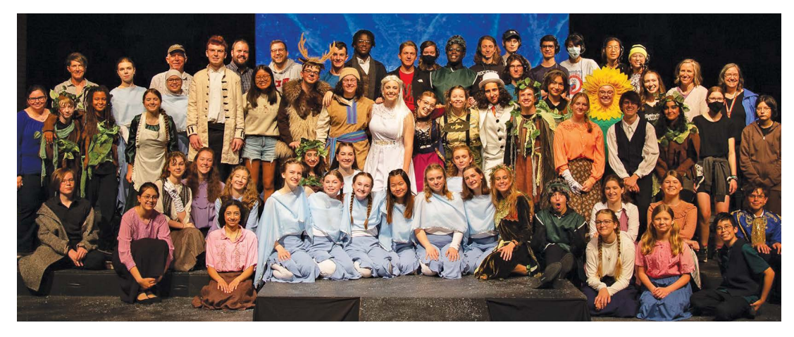
The cast and crew of Rockway's production of FROZEN JR.

In terms of numbers, there were 42 students in the cast and 60 who worked