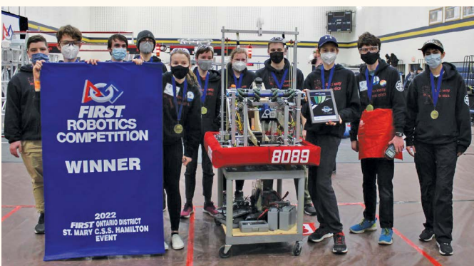
The Rockway Robotics team took Gold at the regional competition in April 2022.

If you have skills to share and time to spare, we'd love to talk with you!