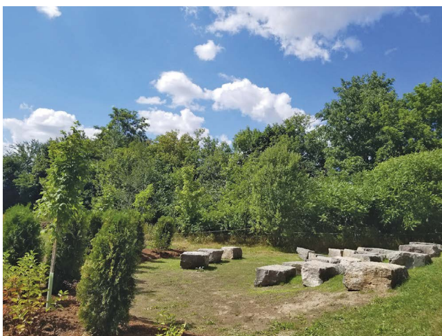
Lush green space surrounds the Outdoor Classroom providing a unique space for students to learn.