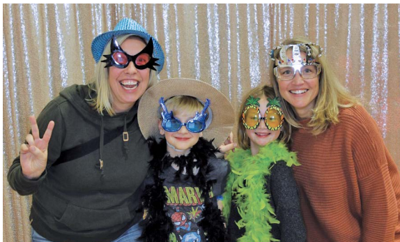
The photo booth was very popular with attendees of all ages.

On Friday, October 28, we invited students, families, alumni and friends back to Rockway for Connections Homecoming Night . It was a fun evening of great food and athletic competition. The event featured our famous Spaghetti Supper and Alumni Sports Challenge.