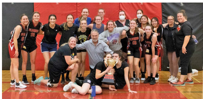
The Sr. Girls Basketball team and alumnae team pose after a fun and competitive game.

that came out to challenge the Senior Boys Volleyball team was impressive. They played a best of five match and needed all five games to determine a winner. Each game went back and forth, but for the first time since 2016, our Senior Boys were able to defeat the alumni and add their name to the trophy.