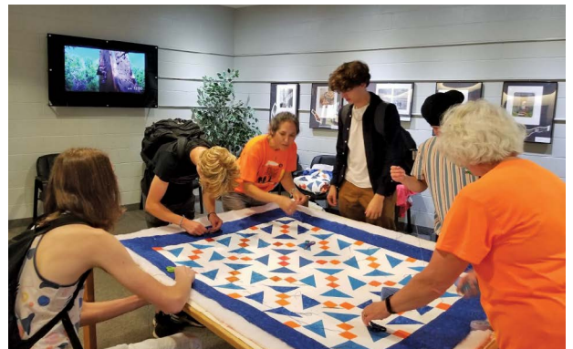
Students help work on one of the quilts from Quilts for Survivors.

an interview-style conversation, our community was able to listen to their perspectives on what reconciliation means to them and what it looks like for schools, in particular, to engage in reconciliation work. It was deeply meaningful for the students of Rockway to connect with the voices of Indigenous students and to be able to relate to them as young people.