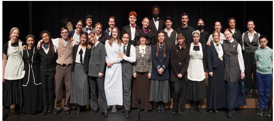
Sherlock cast and crew.

And the show would never happen without a very large group of students and faculty who were the behind the scenes technicians, costumers, prop finders, production assistants and stage managers. Well done!