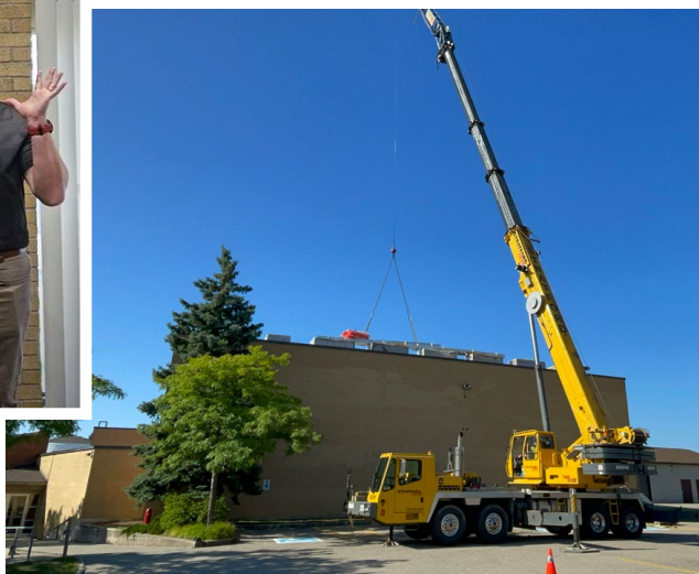
There was a lot of excitement at the end of August as the solar panels started arriving at the school.