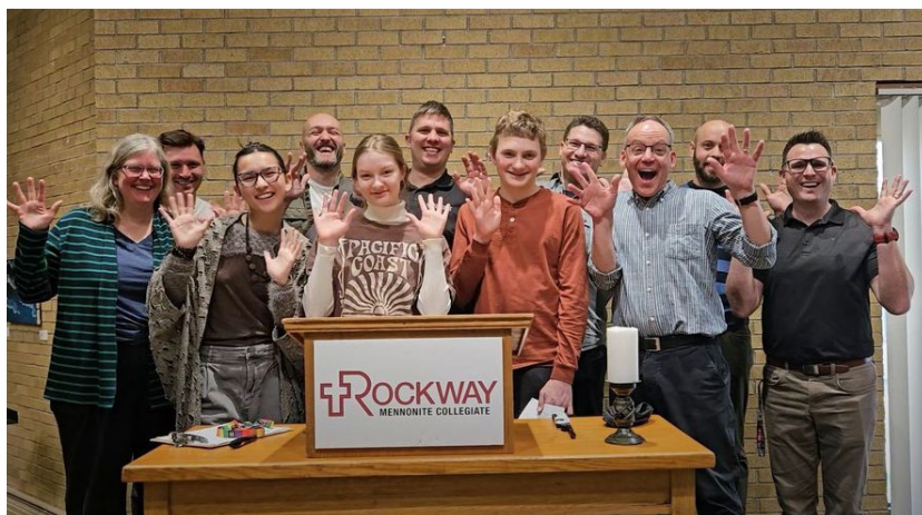
Members of VCT Group, Rockway's admin team and our 2023-2024 Enviro-Social student leaders.