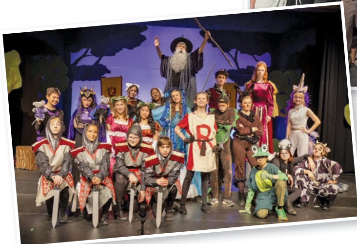
LEFT: Grade 7&8 cast of Camelot & Camelittle