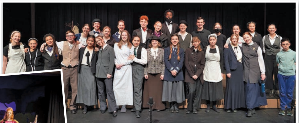
TOP: Grade 9–12 cast of Sherlock Holmes