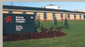
NEW CLASSROOMS & GYM SPACES