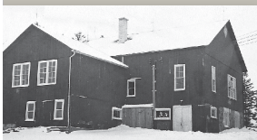
THE ORIGINAL BARN