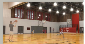
FACILITY AND ACCESSIBILITY UPGRADES