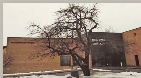
NEW CHAPEL SPACE