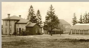
NEW CLASSROOM WING