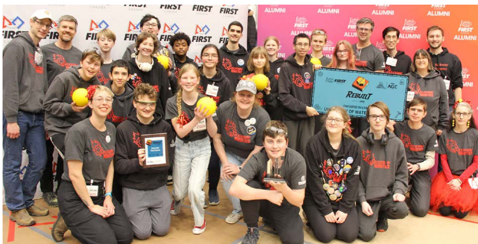
The Rockway Robotics, FIRST Robotics Competition Team 8089

Thank you all, we can't wait to see what next season brings!