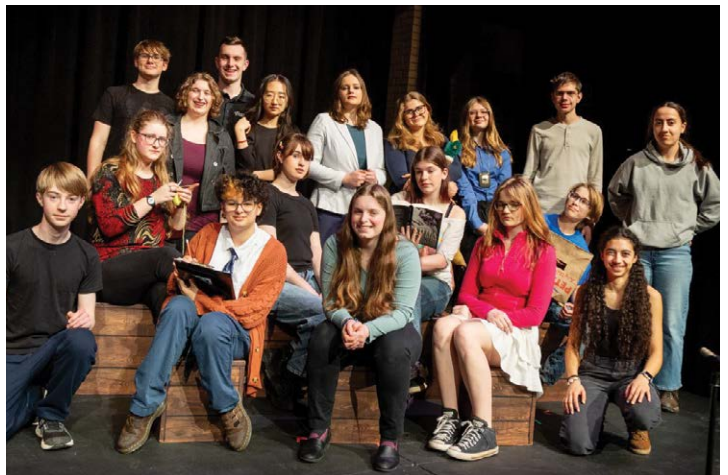
The cast and crew of The Day the Internet Died .

After a decade hiatus, Rockway returned to the National Theatre School (NTS) DramaFest, formerly known as Sears Drama Festival, with our production of The Day the Internet Died . The NTS DramaFest is an annual high school theatre festival where students create and perform one-act plays, developing skills in collaboration, self-expression, and problem-solving in a supportive environment. This incredible student experience has been running since 1946 and involves thousands of students across Canada, offering them a chance to connect with the wider theatre community.