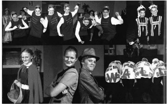
Cast pictures from the 2009 production of Humpty Dumpty is Missing!

It was a pleasure working with students, faculty and staff to prepare our grade 7&8 production of Humpty Dumpty is Missing! This 'comedy caper,' was a delightful spin-off of the 1940's and 1950's 'film noir' detective novels and movies. Our SOLD-OUT audiences delighted in the witty and very 'punny' dialogue as Detective Sammy Scoops and his capable assistant, Alice from Dallas, investigated a variety of 'prospects'. Together with the help of the beloved Old Mother Hubbard and Old Mother Goose, they cracked the case. I am so proud of the incredible production that this talented group of students whipped-up together! Deepest gratitude goes to the Rockway faculty and staff, students, parents and especially our parent volunteers for helping to create this important opportunity for learning and growth. We couldn't have done it without you!